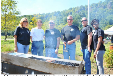
Our great volunteers getting ready to feed all those hungry people!