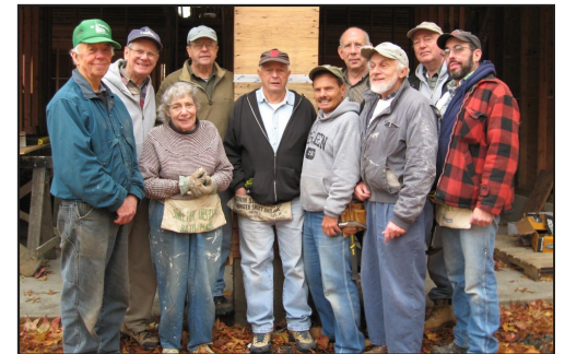
Pictured above are just some of the twenty-nine Habitat Bergen Greyheads.