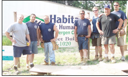
Volunteers from the Teaneck Fire Department were on site at Third Street to lend a helping hand.

As our first four families get ready to move into their new homes on Third Street, we are reminded of the tireless generosity of the thousands of volunteers who have hammered, framed, painted, scraped, spackled, insulated and shared their time and talents with Habitat Bergen. We are so grateful for the individuals and organizations that have given so much to our families and our mission.