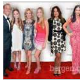
Dressed to Impress: Best...