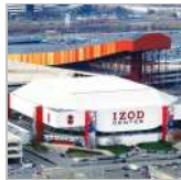
A look back at the Izod Center