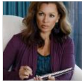
Vanessa Williams to return to...