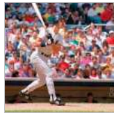
When Yankees lived in Tenafly