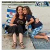
Fair Lawn holds 2015 Movie...