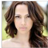
Hair loss treatment without...