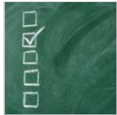
Millburn BOE meets Tuesday;...