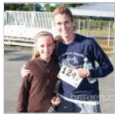
Closter holds 2015 Dom...