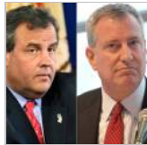
Christie blasts NYC mayor...