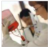
Why and where to give blood...