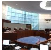
N.J. Supreme Court justices...