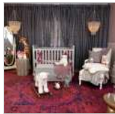
Creative rooms for children