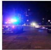
Man shot while driving in...