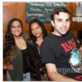
Owl Pub holds 2015 acoustic...