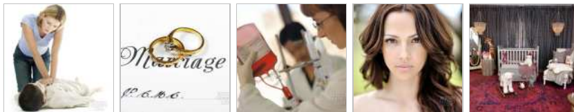
How to help in a medical...