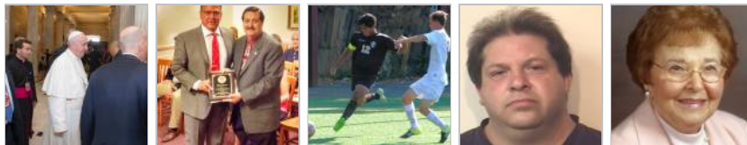
Pope Francis welcomed with...