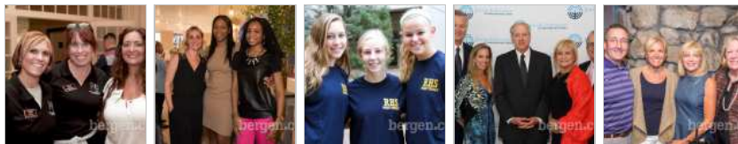
William Paterson University...