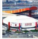
A look back at the Izod Center