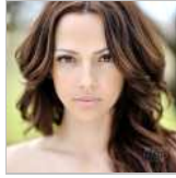
Hair loss treatment without...