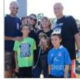
Dumont holds 10th annual 5K...