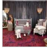
Creative rooms for children