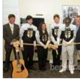
Paramus Catholic High School...