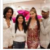
Downtown Englewood holds 2015...