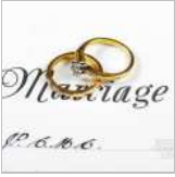
Navigating the post-matrimony...