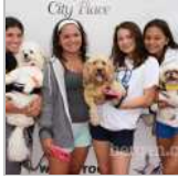
Pet ResQ holds 2015 Woofstock...