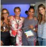
Center for Food Action holds...