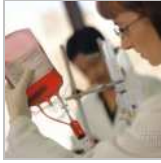
Why and where to give blood...