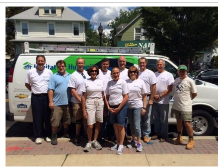
(NJBankers) "Bankers Build" program.

By Post Friday, September 11 2015 @ 07:28 AM EDT