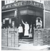
Miles of aisles: Bergen's...