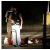
Police: Man who fired at...