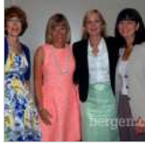
Valley Hospital Auxiliary...