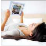
Parent guidelines for teen...