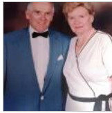
Former Pequanock resident...