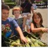
Westwood holds 2015 farmers'...