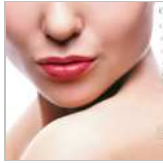
Goodbye to the double chin