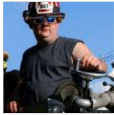
Butler Fire Dept. captain...