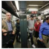
US stocks climb, breaking...