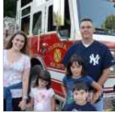
Hillsdale residents gather...