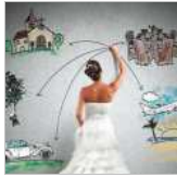
Bridal resources from A to Z