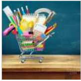
10 tips for back-to-school...