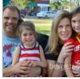
Westwood holds 2015 summer...