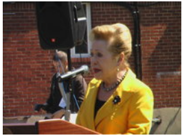
IMGA0033.JPG Browse Album

development of youth leaders who are advocates of decent, affordable housing. Youth United also provides opportunities for leadership including participation in strategy sessions, sharing committees and serving on the Steering Committee. Members meet twice per month to plan recruitment strategies, advocacy events, and fundraisers. Volunteers ages 16 and older also have the ability to do hands on construction on our build sites. http://www.bergenyouthunited.com .