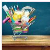
10 tips for back-to-school...