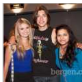
Maranatha Church holds 2015...