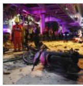
Bomb blast rocks Bangkok...