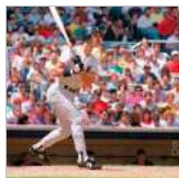
When Yankees lived in Tenafly