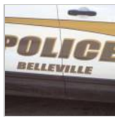
Belleville: Police blotter,...