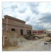
Butler's 'Golden Mile' of...