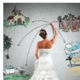
Bridal resources from A to Z