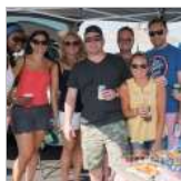
Country fans gather for Kenny...