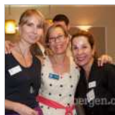
Fort Lee Chamber holds 2015...