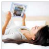
Parent guidelines for teen...