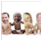
Famous people who entered the...