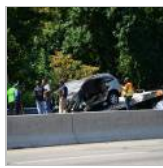
Third person dies from...