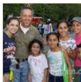
Paramus hosts 2015 National...