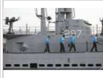
Bergen County Bucket List