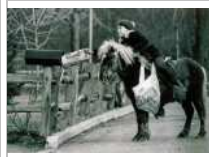
Carrying history: Paperboys ...