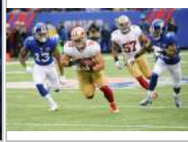
49ers' Chris Borland retiring ...