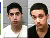
Two teens charged in three ...