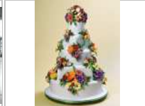
(201) Bride: Wonderful ...