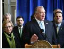
N.J. Senate leaders urge Port ...