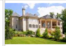
Prominent Properties' most ...