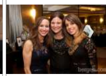
Upper Saddle River ...