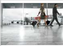
How to avoid airport ...