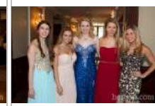
Immaculate Heart Academy ...