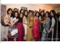
bergenPAC hosts 2015 Indian ...