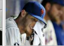
Klapisch: Mets paying for not ...