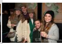
Bergenfield hosts 34th annual ...