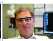
Journalism scholarship to ...