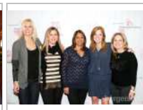
Triple Negative Breast Cancer ...