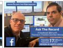
In Heroin's Grip: Join a live ...