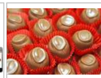
Bergen County's chocolate ...