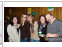
Midland Park Panthers ...