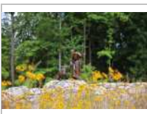
Pre-planning a funeral: ...