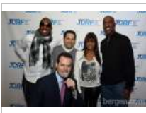
Juvenile Diabetes Research ...