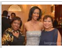
Jack & Jill Fund hosts 2015 ...