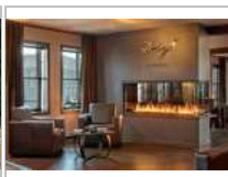
Where to find Bergen's most ...