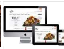
Responsive website design: ...