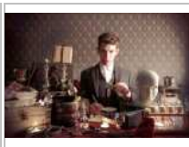
Montclair-area cafes to host ...