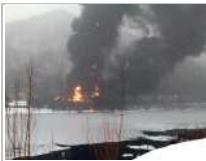
West Virginia oil train ...