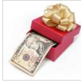
Holiday Tipping Guidelines