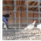
Fresh Poultry: In your...