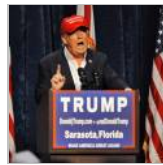
Trump says black pastors...