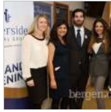
Hackensack UMC partner...