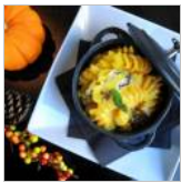
Mac and Cheese: America's...