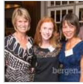
St. Paul's Community...