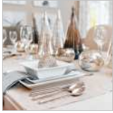
Festive holiday table settings