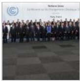
Obama: Climate talks an 'act...