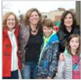
Ridgewood Guild holds 2015...