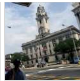
Paterson looks to hold...