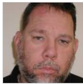
New Milford man accused of...