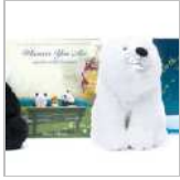
(201) Family's 2015 Holiday...