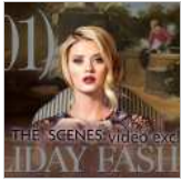
Behind the Scenes: (201)...