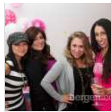
Kidville holds 2015 Ladies...