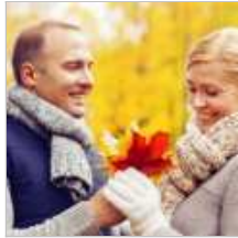
Finding Mr. Right: Why Women...