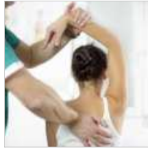
(201) Magazine's Top...