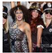
Blue Moon Mexican Café holds...