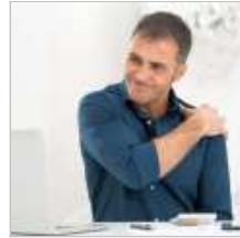
Causes and treatment of...