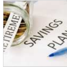
Retirement: How to Make it...