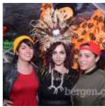
Jalapeños Mexican Grille...