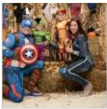
Wyckoff Chamber of Commerce...