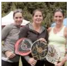
Oasis holds 2015 "Lobs for..."