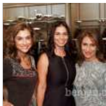
Valley Hospital Auxiliary...