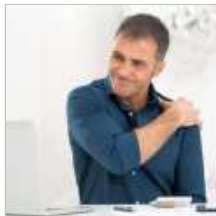
The benefits of getting...