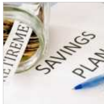
Retirement: How to Make it...