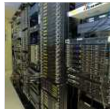
Choosing the best web hosting...