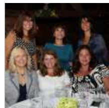
Friends of Hackensack...