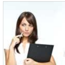
7 tips for planning a...