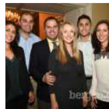
Dwight-Englewood School holds...