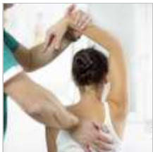
(201) Magazine's Top...