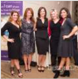
Children's Aid and Family...