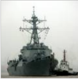
China warns US Navy after...