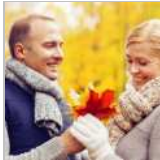
Finding Mr. Right: Why Women...