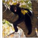
Bear removed from tree after...