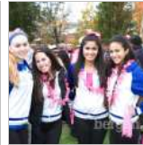
Englewood Hospital holds 2015...