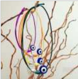
Protecting yourself from the...