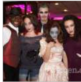
Kostumes4Kids holds 2015...