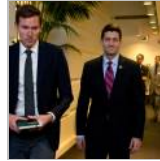
GOP, Dems, Obama reach accord...