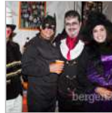
McCooe family holds 2015...