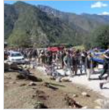
Death toll reaches 311 in...