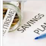
Retirement: How to Make it...