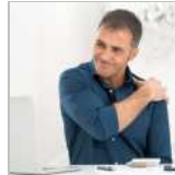
Causes and treatment of...