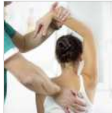
(201) Magazine's Top...