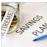
Retirement: How to Make it...