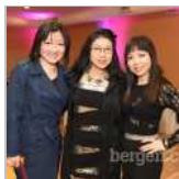
Studio K Dance Center holds...