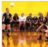
Girls volleyball: Cedar Grove...