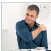
Causes and treatment of...