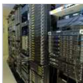
Choosing the best web hosting...