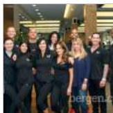
THE GYM holds 2015 push-up...