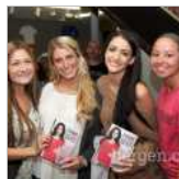
Fans greet reality TV star...