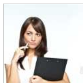
7 tips for planning a...