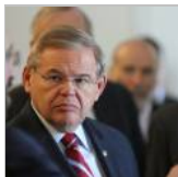
Sen. Menendez spent almost...