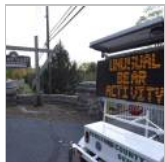
Brazen bears spark fear; 4 of...