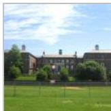
Teacher layoffs prompt...