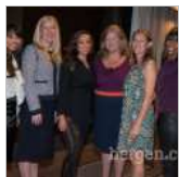
Exposure North Jersey and...