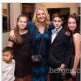
Elizabeth Morrow School...