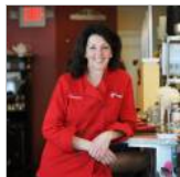
Giovanna's Cafe in Ramsey to...