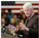
Bill Clinton kicks off tour...