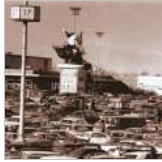
Christmas Past: Decking the...