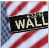
Stocks sink on first day of...