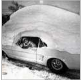
Bergen snowstorms through the...