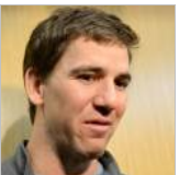
Giants' Eli Manning on...