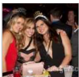
The Terrace in