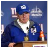
Tom Coughlin steps down as...