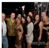
Boom Burger holds