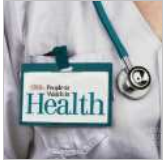
(201) Magazine's People to...